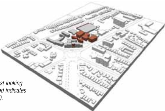
View from northwest looking toward complex (red indicates proposed new infill).