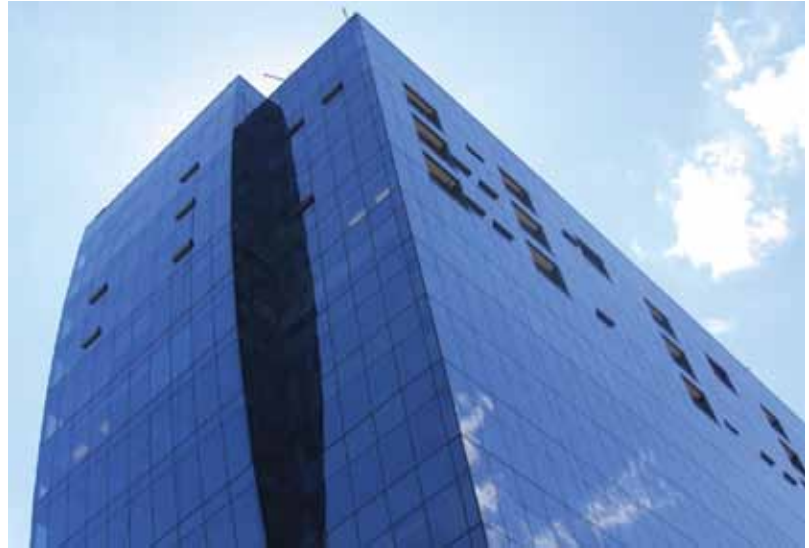
The Dulski federal building is one example of many recent conversion projects in the city of Buffalo.

Condominium projects in the city are scarce, but activity is growing at the very low and high ends of the market. Two such projects are the mixed-use, high-end Avant, the conversion of the Dulski federal office building to hotel, office, and residential condominiums, and Lakefront Boulevard Condominium, both upper-income projects. The former Hotel Lafayette in downtown Buffalo is being redeveloped