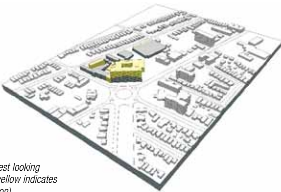
View from northwest looking toward complex (yellow indicates proposed demolition).