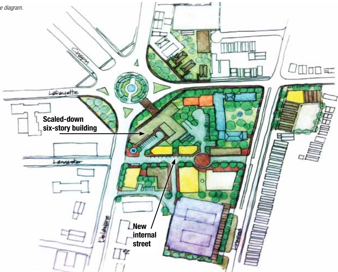
Proposed land use diagram.

The panel recommends that approximately 90 percent of the main monolithic building be taken down to its original height of six stories, using articulated massing to make it more compatible with the surroundings. Instead of being a dividing wall as it is now, it will act as a “catcher’s mitt” to Chapin Parkway, softening the edges of the circle. The views looking up Chapin Parkway from this building would be extraordinary and command a premium.