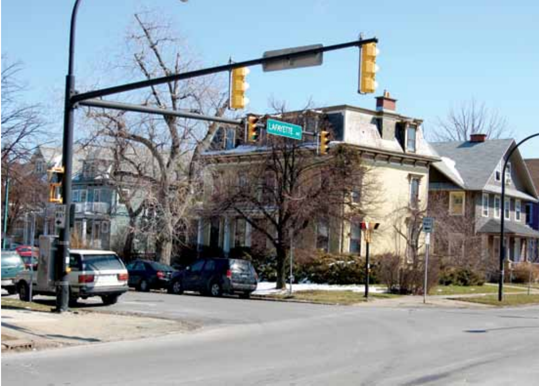
The area directly adjacent to the complex is composed of lower-scale buildings such as these three-story residences.